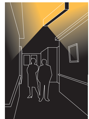
Bedhead and Corridor versions are available. Corridor versions can be either ceiling (pictured) or wall mounted.